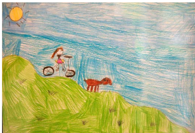
From My Bracknell Forest Art Exhibition

We look forward to being able to put this plan into action and reporting on our progress in a year's time.