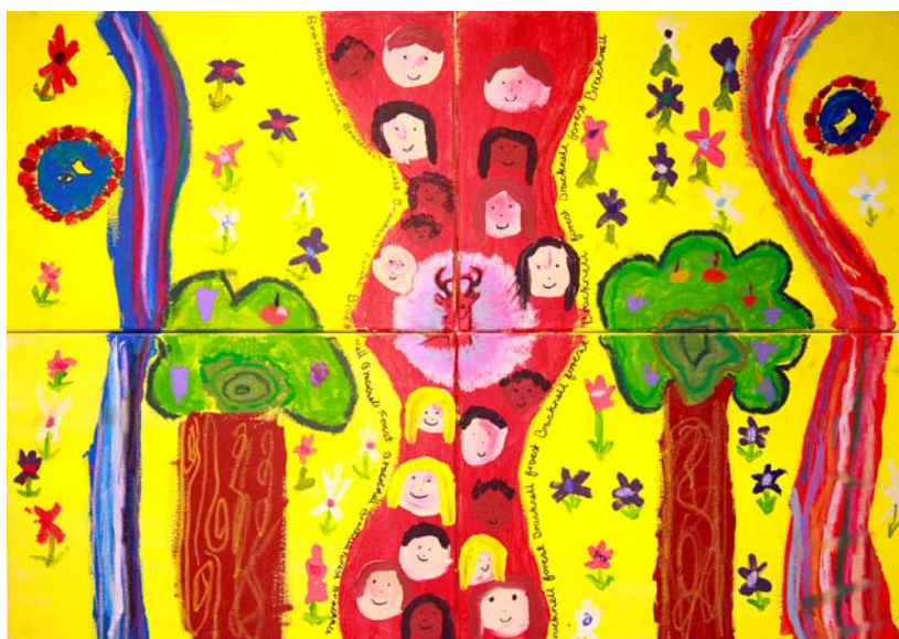
From My Bracknell Forest Art Exhibition